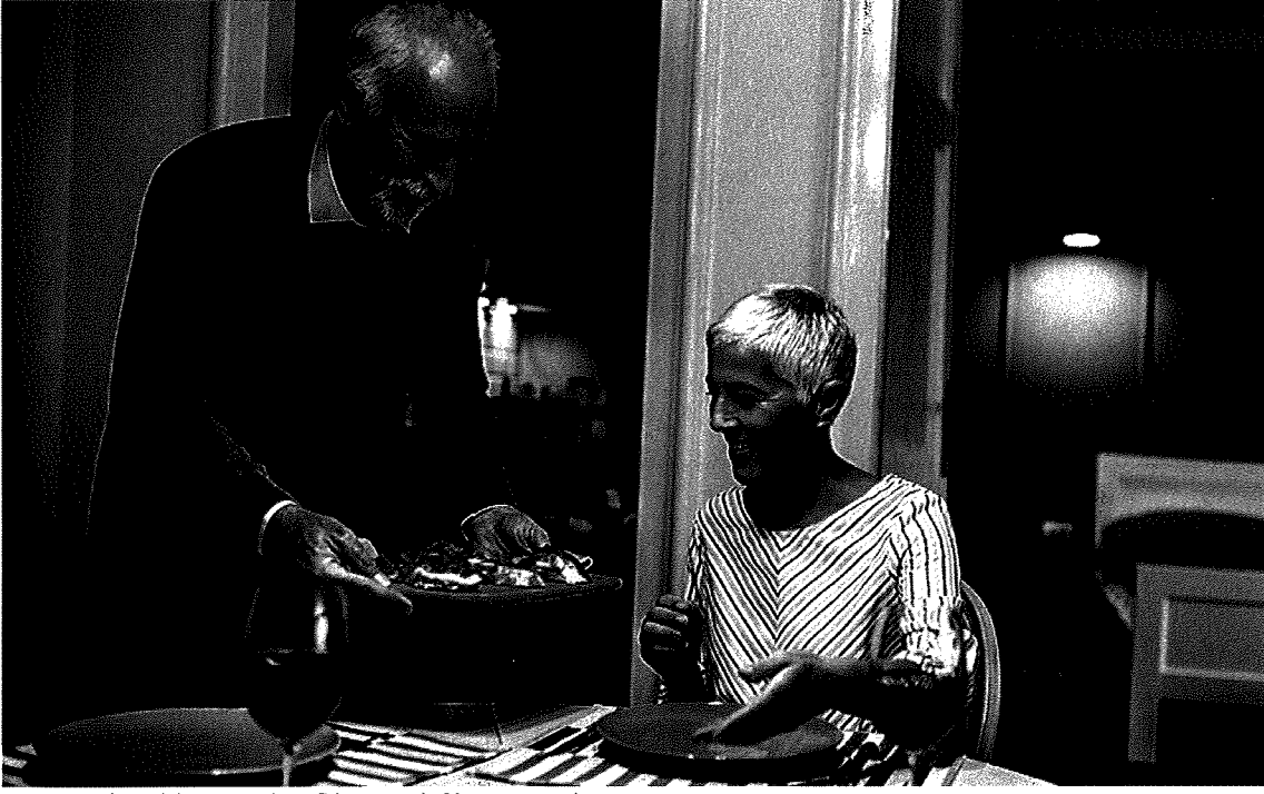
Housing for older people